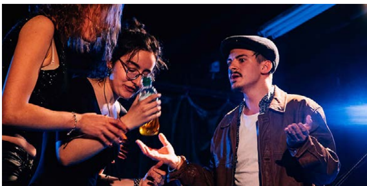
Bottom right: Exhibition opening evening