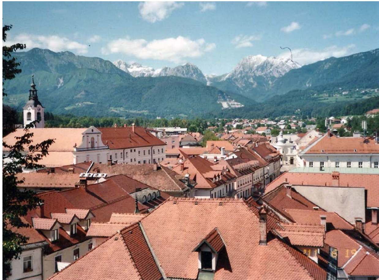
Photo below: View over northern part of Kamnik from Mali grad Hill.

Learn more about Kamnik by visiting: https://www.slovenia.info/en/places-to-go/regions/ljubljana-central-slovenia/kamnik .