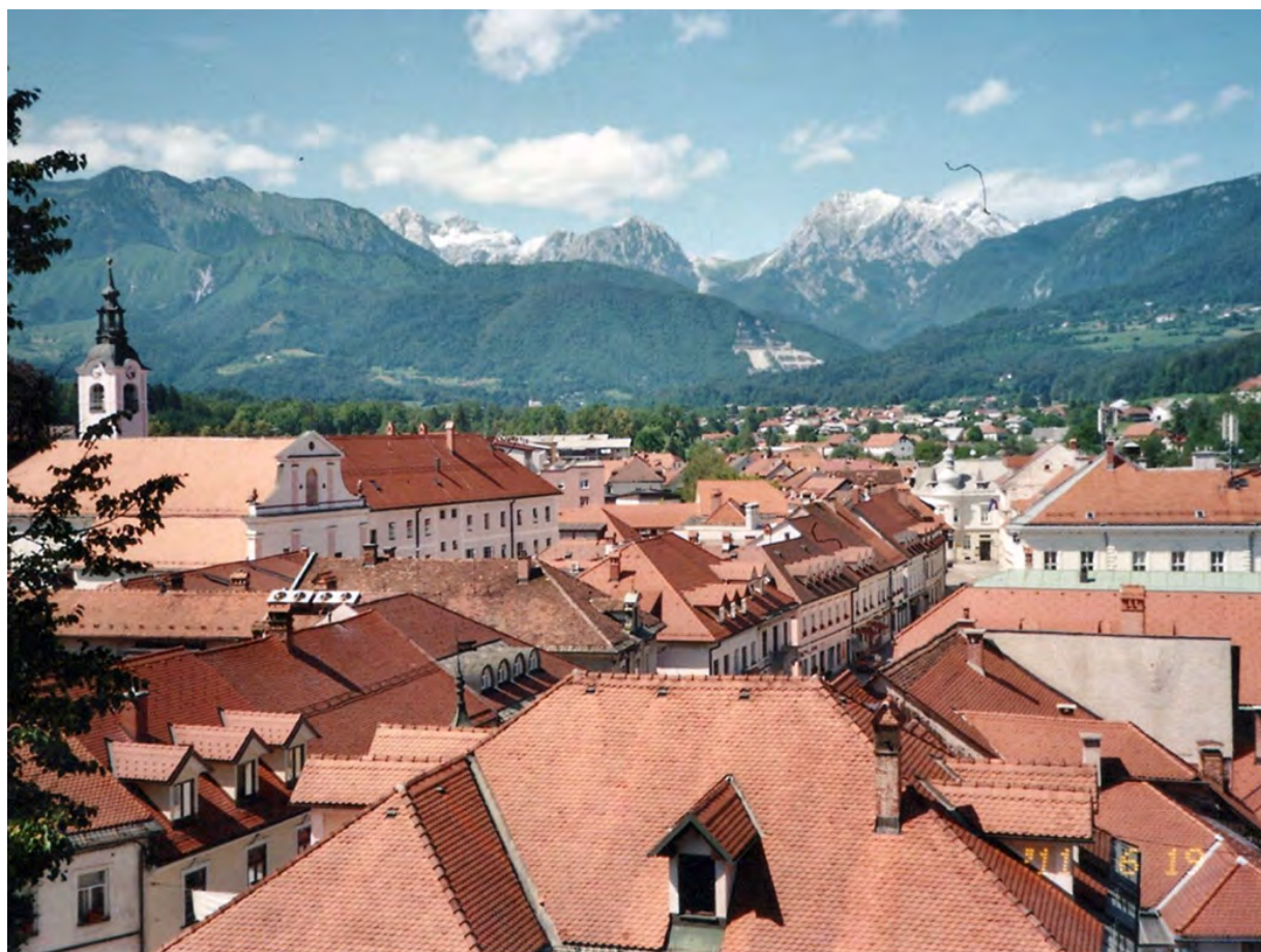
Photo below: View over northern part of Kamnik from Mali grad Hill.

Learn more about Kamnik by visiting: https://www.slovenia.info/en/places-to-go/regions/ljubljana-central-slovenia/kamnik .