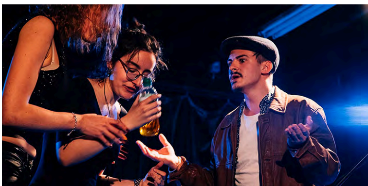
Bottom right: Exhibition opening evening